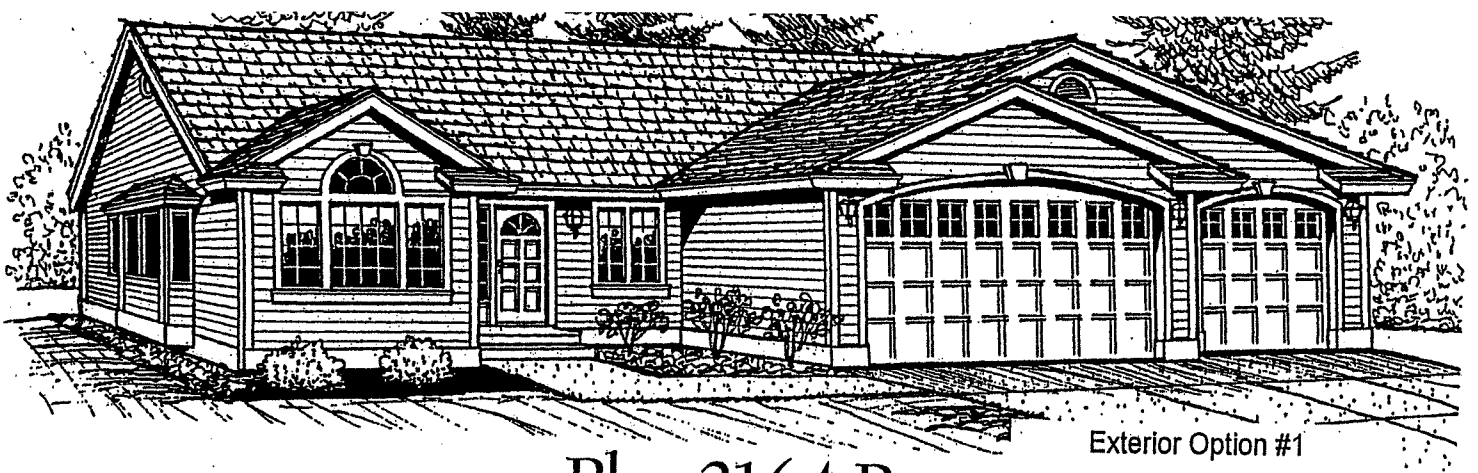
Exterior Option #1